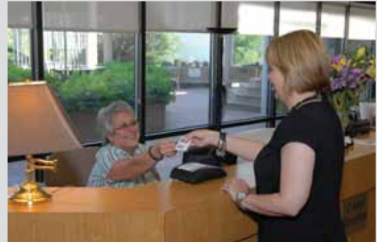
At check-in patients receive a customized RF tag