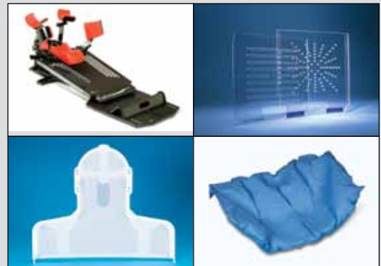
RFSeries provides a broad array of products with RF tags